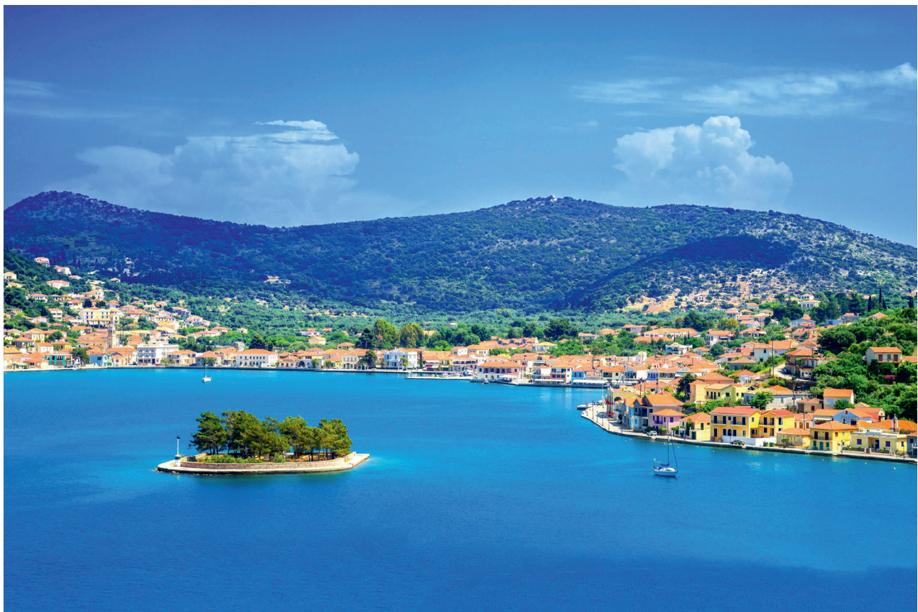
View of the island's beautiful harbour.

Should you book two holidays with us in the same season at full brochure price, we will reduce the cost of your second holiday by 15%.