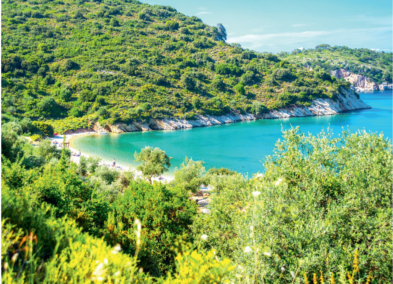
The beautiful Filiatro beach.