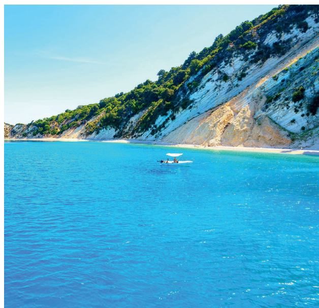
The treasure-beach of Platia Ammos.

Platia Ammos is Ithaka's treasure-beach. Like most beaches on the island, Platia Ammos is surrounded by beautiful trees and like Agios Ioannis its shore is sandy and the waters are turquoise. You can only access the beach on a boat from Afales bay and you will usually find yachts and boats off the coast enjoying the crystal waters and the view of the majestic sand cliff behind and over the beach.