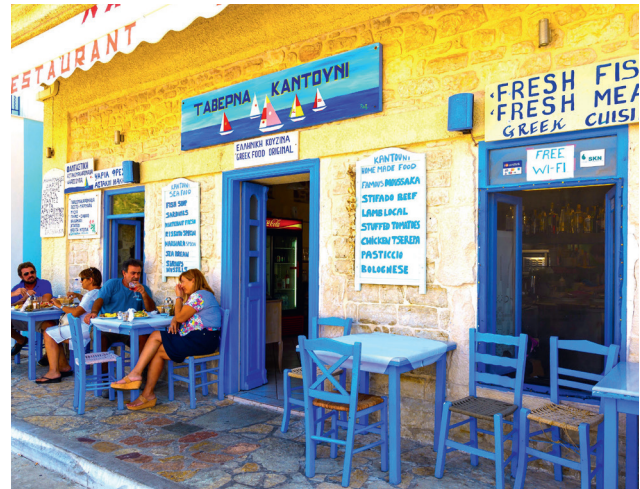
Taverna in Vathy.

of Kefalonia and Patras on the mainland. The countryside in the immediate vicinity is glorious. Quiet lanes and tracks lead up the fertile valley behind the town from where newly opened footpaths can be taken to places straight out of Homer's Odyssey . The town itself contains fascinating alleyways and stepped paths often lined with the walls of elegant ruins, their archways and windows covered in wisteria.