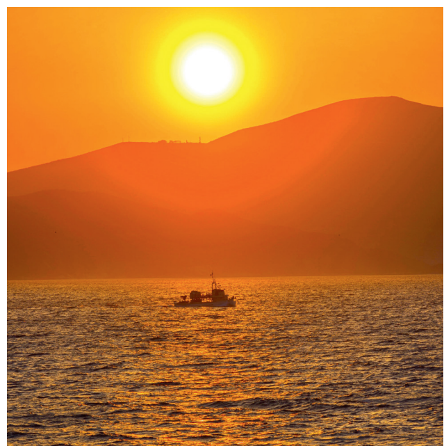
Sunset in Ithaka.

Nightlife on the island revolves around the plateias or squares. Every village has one and throughout the summer a series of religious festivals are celebrated. These all night affairs, where the wine flows freely and songs and traditional dancing are enjoyed by the whole community, young and old, should not be missed. These "Panagiria" are not contrived tourist occasions full of Zorba wannabes and plate smashing, but merely the Greeks doing what they do best, providing hospitality and enjoying themselves! Ithaka is neither a 'grand' not 'in' holiday destination, at least in the context of the trade writers' world of hyperbole and fashion, nor is it a small island lost in time and obsessed with an ancient myth. It has taken on board the trappings of everyday life in modern Europe, ATMs, internet cafes, satellite television, good communications and last but not least, modern plumbing! New cars are readily available to hire, road surfaces have been improved, restaurants and shops modernised, air conditioning and swimming pools have been installed, but in the process has not lost sight of its soul. It is an island where a holiday can easily become a way of life!