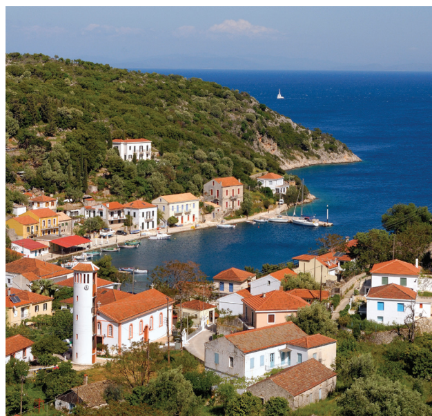
Panorama of Kioni

If you feel like a bit of exercise, there's a superb old mule track, now a footpath which climbs all the way up the wooded mountainside to the village of Anoghi. The present settlement in this village dates from 16th Century but the original 13th Century village, now ruined, lies a little higher up the hill. The church here, despite its unremarkable exterior contains some of the best frescoes in the region. To gain entry to the church the village