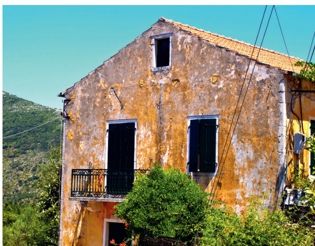
Old house in Stavros.

the inhabitants, with talk of border controls and passports between the two halves! While Vathy is the cosmopolitan hub of the south, the North is very different in character, although it shares a similar mountainous interior.