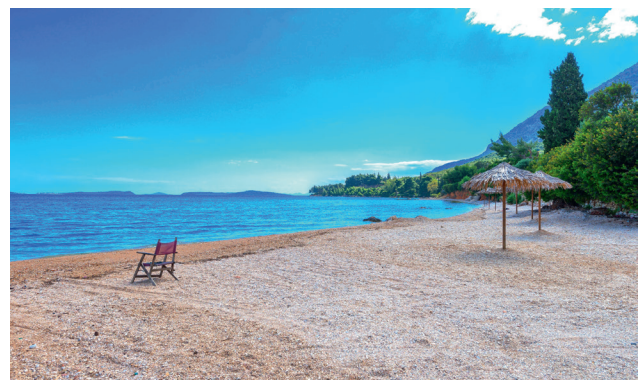
Agios Ioannis beach.

when he got back to Ithaka from his 10 year long journey. Just off Vathy, at 2km from the capital and on your way to Aetos, you will enjoy a blend of sand and pebbles giving to clear blue waters and natural shade from the trees surrounding the beach. Dexia also has a lifeguard as well as a beach bar.