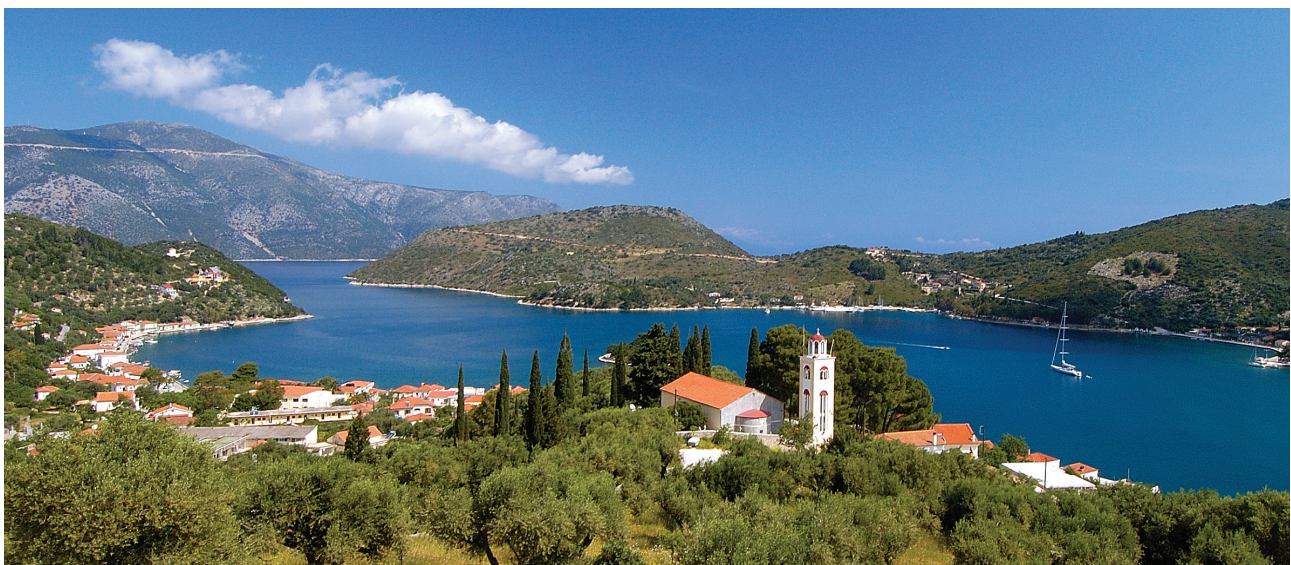
Panorama of Vathy.

On summer evenings everyone makes their way to the plate beside the harbour, the road is closed off to traffic except where children on their bicycles race ahead of their parents enjoying a traditional 'volta' or stroll before their evening meal.