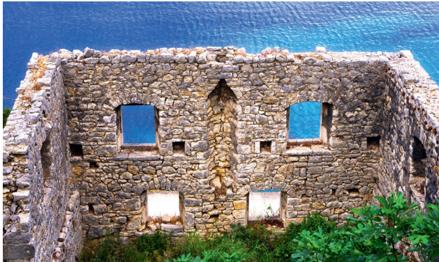
A ruined house in the picturesque village of Kioni.

KIONI The traditional village of Kioni is located 20km north of the capital, Vathy - lying on the northeastern coast of the island. Throughout the years, since its establishment in the 16th century, the village of Kioni has seen a number of devastating earthquakes but its people have done well in protecting and preserving their hometown.