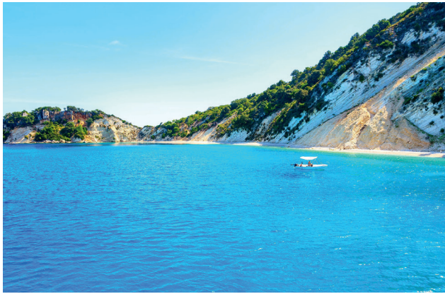
Off the coast of Ithaka.

expressed (Ithaka is in Greece when all's said and done!) everyone agrees that the uniqueness of the island must be protected.