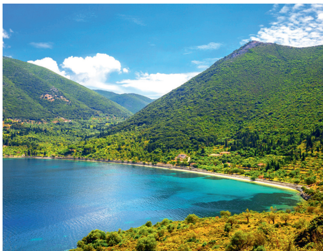
Mythical and green Ithaka.

kafenion, next to the Venetian bell tower will supply you with a key. The kafenion is also worth a visit barely having changed in a hundred years. This completely authentic meeting place was chosen as the model for the kafenion in the recent film of Captain Corelli's Mandolin.