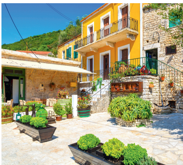
Kioni village in Ithaka.

However, Ithaka is much more than a sleepy, romantic island locked into a mythical time warp. Odysseus was only the first in a long line of Ithakian men who have sailed across the oceans of the world. This connection with foreign lands means that there is a real cosmopolitan feel to the island that blends with the islanders' natural hospitality and their spirit of independence. Once seen as Kefalonia's poor relation, Ithaka now has its own administration which allows for more control over the development of their island and recent years have seen major improvements in the infrastructure. Most homes and businesses are owned and run by the islanders themselves and whilst political differences are vigorously