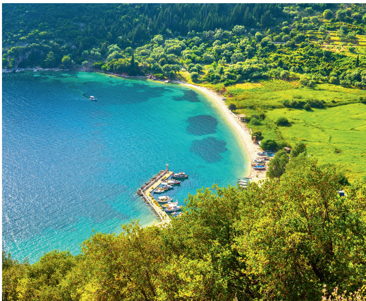
Pure green and blue at Aetos beach.