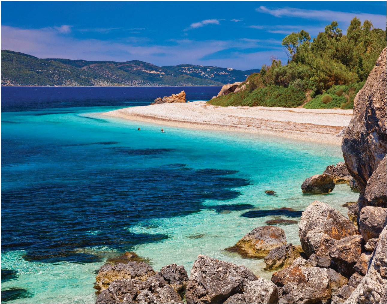
Agios Ioannis beach.

Skinos and Sarakiniko. There are also regular boat trips to the inner islands, like Atokos and Kalamos. Self-drive boats can also be hired for further exploration of the coastline.